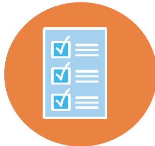
Governance processes are embedded and sustainable