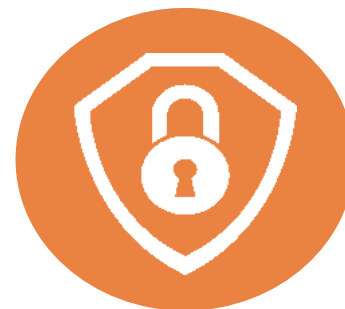
Awareness and involvement of duty of candour