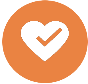
Equality and Diversity Strategy