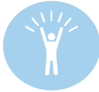
Staffing levels suitable for services provided