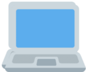
Access to information for ward staff