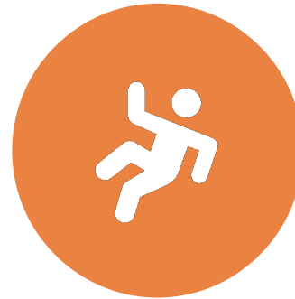
Timely completion of serious incident reports