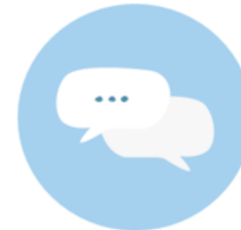
Patients involved in treatment planning and care